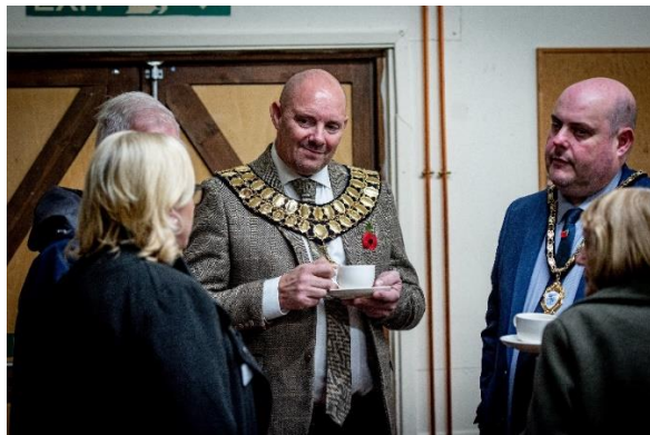
Stotfold Mayor and Deputy Mayor enjoying refreshments after the service.

cutting cake with Stotfold Mayor. Cake kindly donated by The Academy of central Bedfordshire