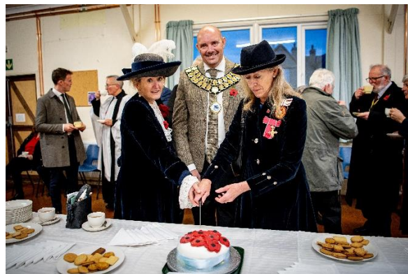
The High Sheriff of Bedfordshire and Deputy Lord Lieutenant

Saturday 29 November – Stotfold Christmas Lights Switch on