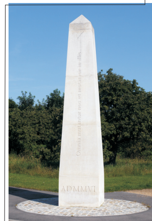
The Obelisk in Fairfield Park

Turn right on to Hardy Way to pass another orchard [C]. Where the houses end turn right along Elliot Way . Pass a sign to the Health Club and stay on the path through trees. Pass the old Chapel on your right and reach the 'North' roundabout.