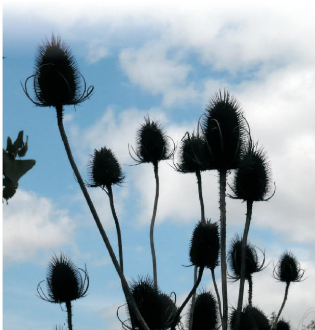
All photographs © Larry Stoter unless otherwise stated.

The walks were produced by TEASEL – the local conservation group. A combined map of all the walks showing how they are linked and notes on interesting flora and fauna which you are likely to see at different seasons can be found on the TEASEL website: www.teasel-info.com .