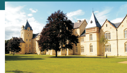
Part of the main Fairfield Hall buildings