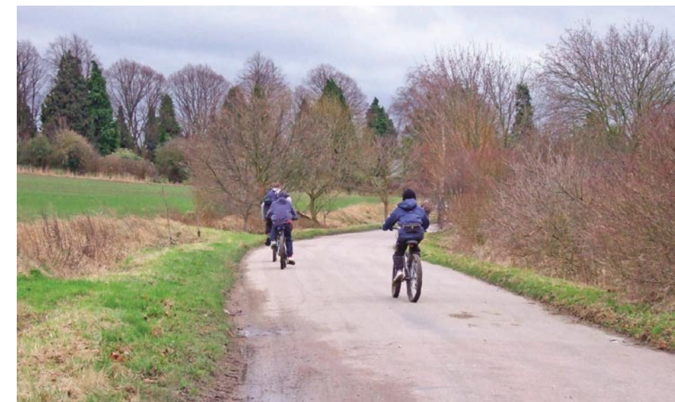
The rural area east of the town is much valued for recreation and relaxation.

There must be provision of housing designed for the elderly members of the community, some of it sheltered, so that they can remain in Stotfold, close to their families and friends.