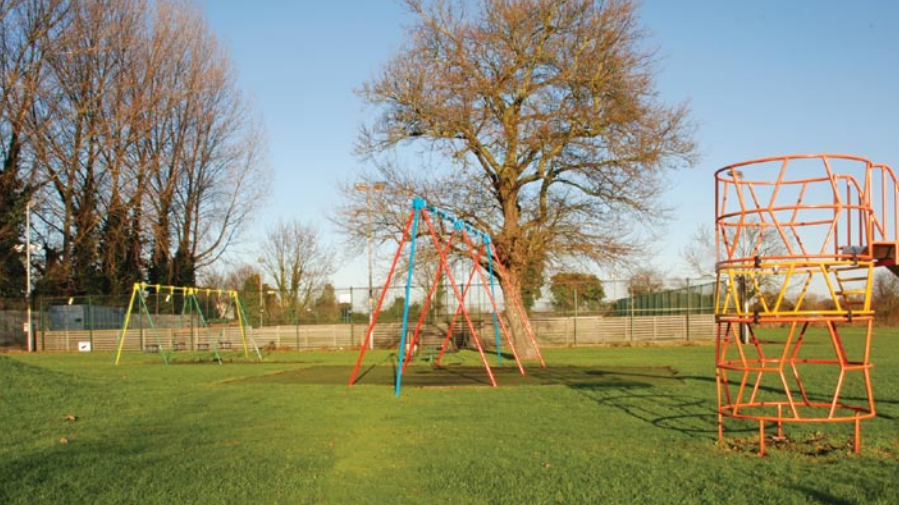
The Riverside Recreation Ground (incorporating Multi Use Games Area).

Very few respondents (148) currently use the Multi Use Games Area at the Riverside Recreation Ground, which represents just less than 50% of those