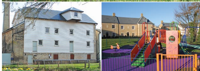
Clockwise from top: The historic Ford Bridge on Malthouse Lane; children's playground at Fairfield Park; the restored Stotfold Mill on Mill Lane.

We trust that this Plan will be taken into account by those making decisions that will affect us