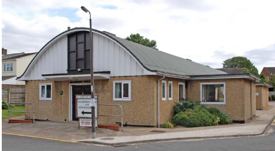
The Memorial Hall, Hallworth Drive.

The question of which facilities residents might use most received a high number of responses, indicating a significant level of interest. There is a real demand