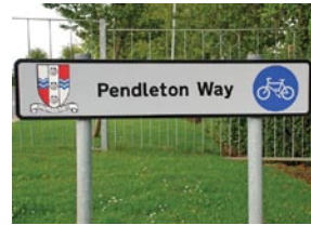
A two kilometre stretch of cycle path links Stotfold and Arlesey.

There was a large majority in favour of measures to reduce the amount of