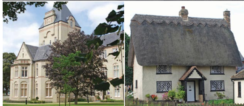
Clockwise from top: recently constructed houses within the Fairfield Park development; an older thatched property in central Stotfold; Grade II listed Fairfield Hall, now converted into luxury apartments.

However 25% of responses stated that no more land should be developed.